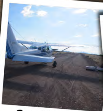
One of NTMA's practice dirt airstrips