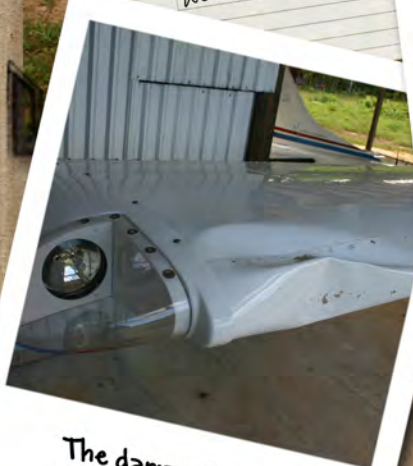
The damaged wing

Thank everyone at Compass for all their work preparing the 206 for service in Honduras. We regret to report an unfortunate encounter with a small tree. Would you be available to come to Honduras for two weeks?