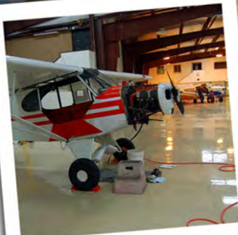
The NTMA hangar in McNeal, Arizona